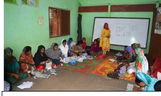
Discussion on tailoring training