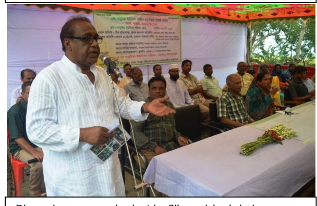
Discussion on open budget by Zila parishad chairman