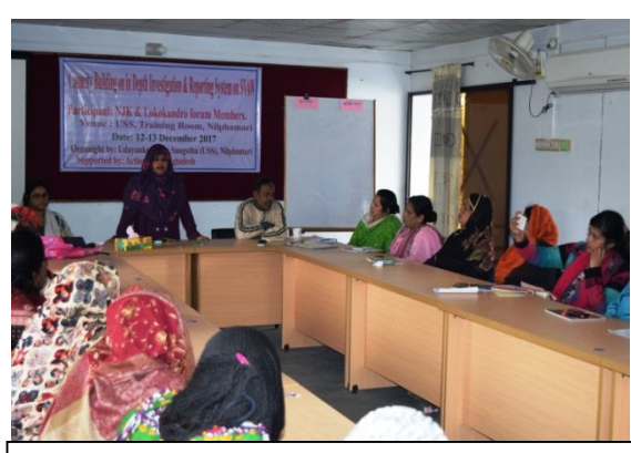
Capacity building training on fax finding & report writting